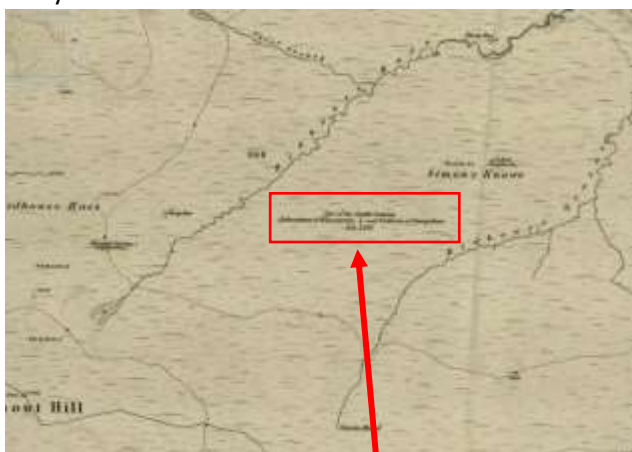
Ordnance Survey Map

* The numbers slain and the names of those involved in the Biddes-Burn skirmish are very similar to those in the 1503 story but with their roles reversed!